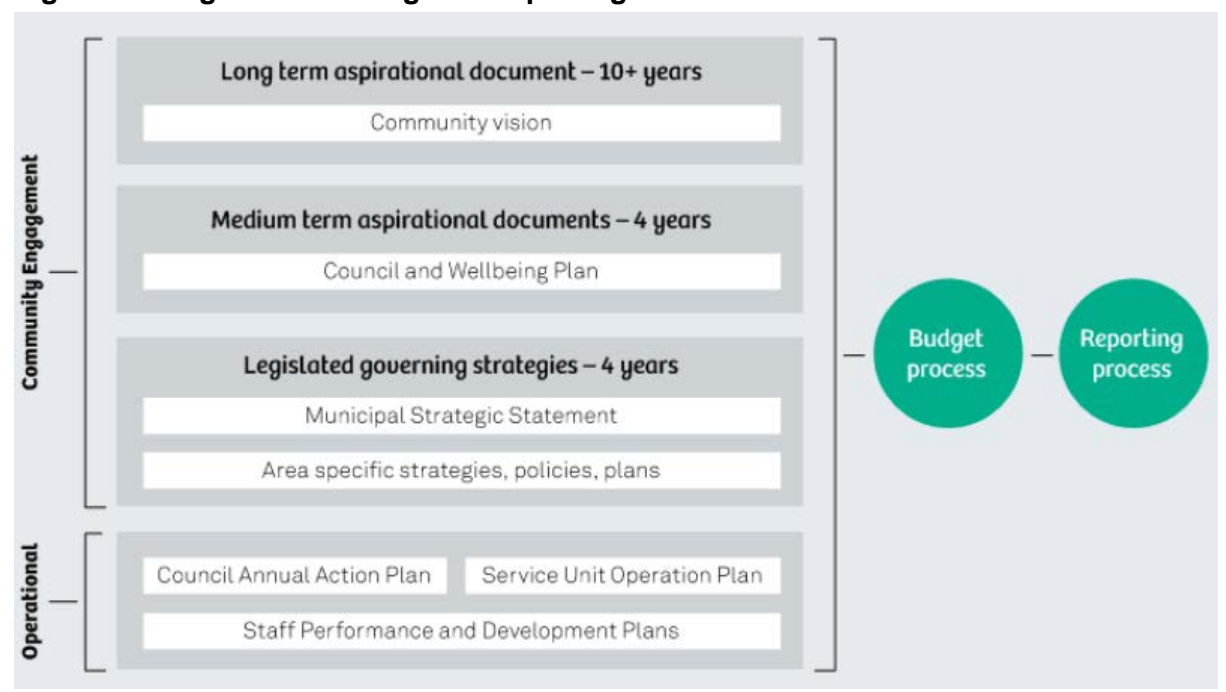
Figure 2: Integrated Planning and Reporting Framework

The process to develop these documents has been shared and therefore each document reinforces and reflects the other. This shared foundation has established a strong strategic base to develop other key documents including the amalgamated early years, youth, older people and disability strategy, and the Environment Plan over the coming four-year period.