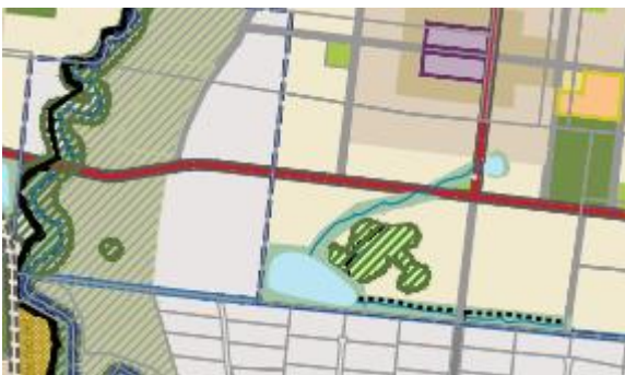
Figure 2: Toolern PSP Drainage Reserve Alignment – Property ID #29

In addition, the location of the basin the Merevale Walk is currently shown as being offset north of the East-West Arterial Road, whilst in fact it should be shown as located directly adjacent to this road (Figure 3).