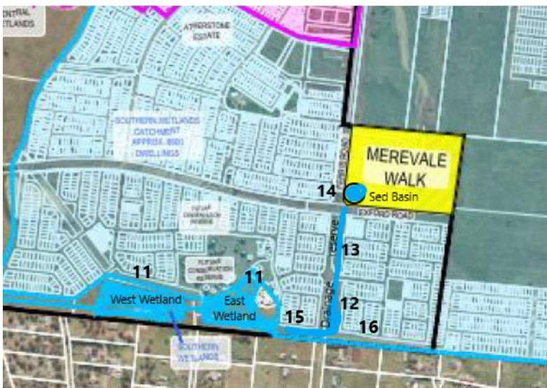
Figure 3: Proposed Changes to Toolern PSP Drainage Reserve Alignment – Property ID #29

The Amendment should be updated to reflect the alignment of this Sed basin, drainage reserve and the Wetlands as previously agreed by Melton Council and Melbourne Water (Figure 3).