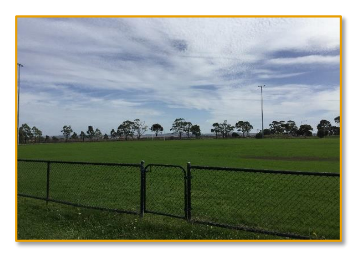
Realignment of oval #2 to achieve a north-south orientation is a key Master Plan priority.