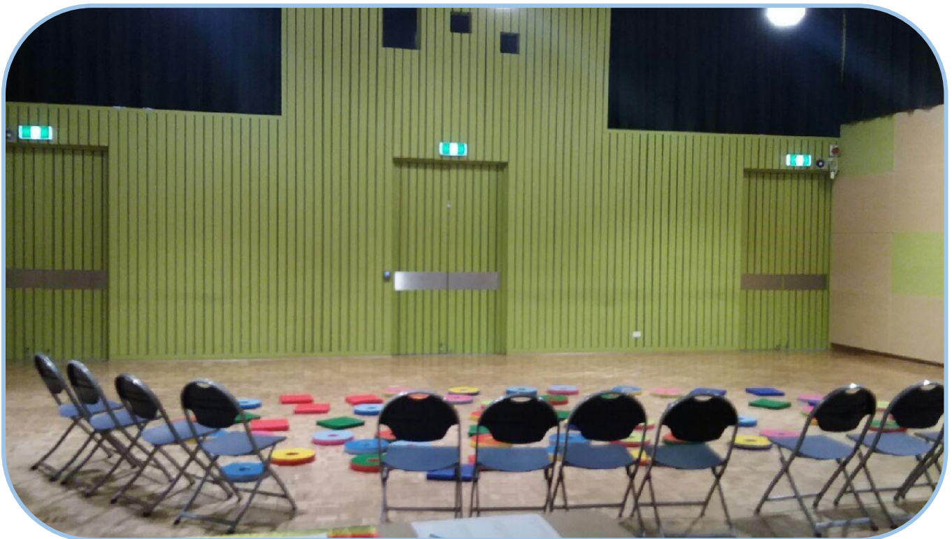
This is the room where we watch the show.