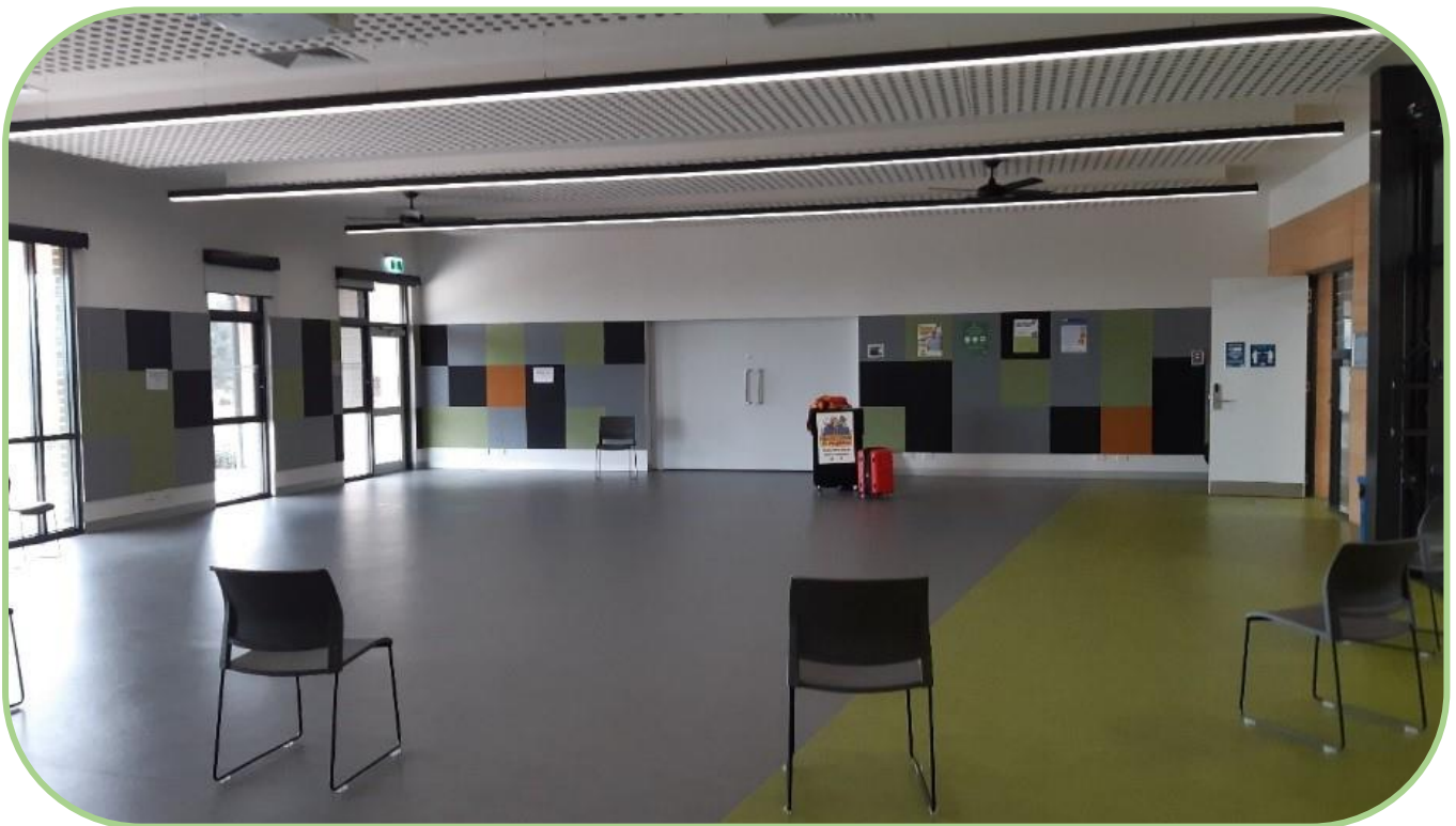
This is the room where we watch the show.