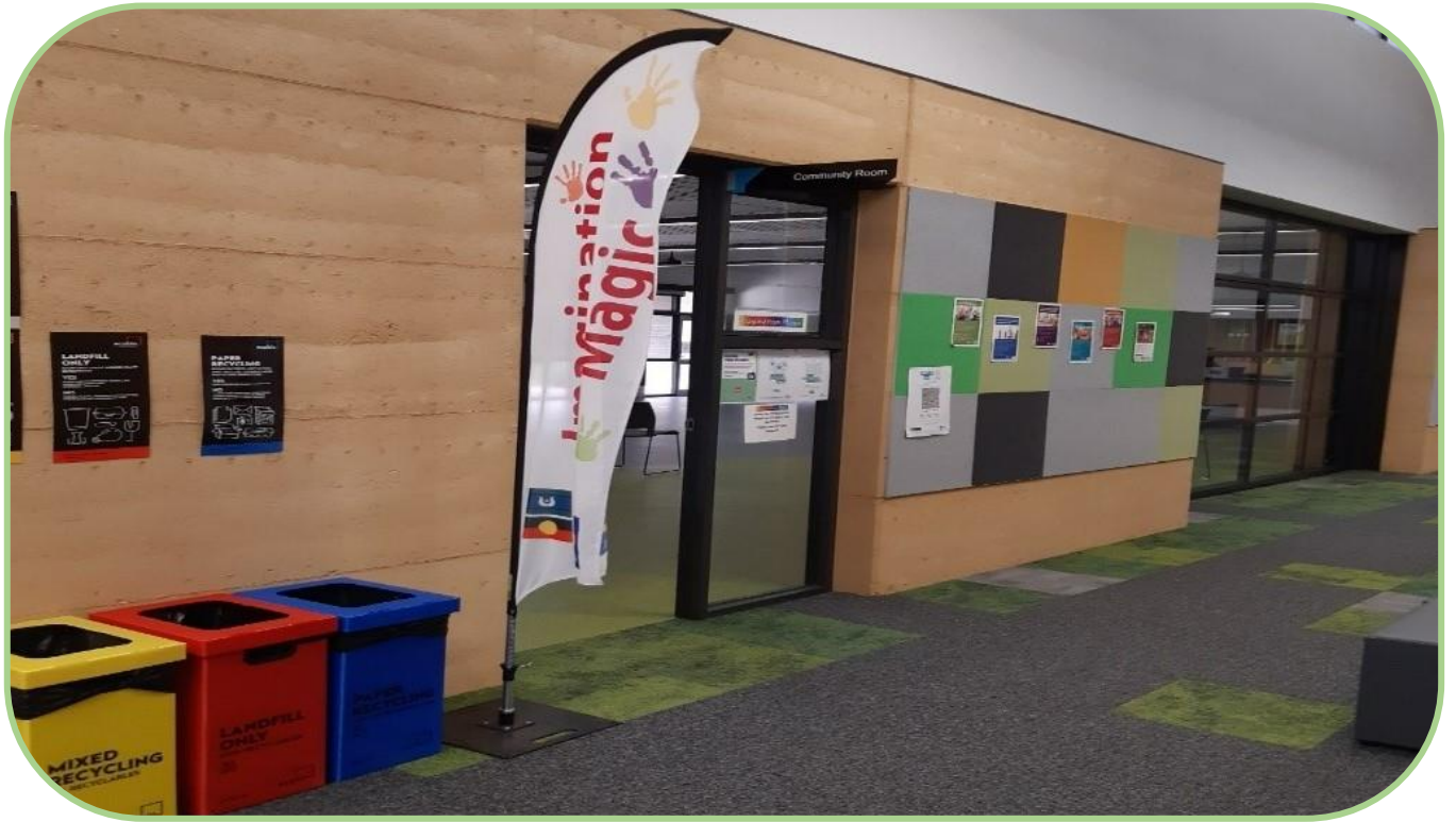
This is the foyer space where we wait to go in to see the show.