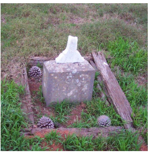
Image dated c.2002, showing the grave at that time recessed in a small timber framed area.