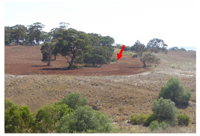
View looking north from Greigs Road. The grave site is indicated.

The gravestone is located in the central part of the property, set in a small group of trees towards the edge of a ploughed area. It is near the edge of the plateau where the land falls away to the Toolern Creek. The Exford homestead is to the west and the Strathtulloh homestead to the east.