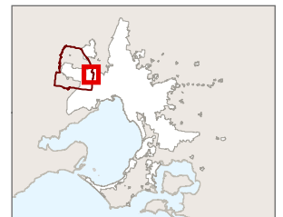
Part of Planning Scheme Maps 10DPO & 14DPO