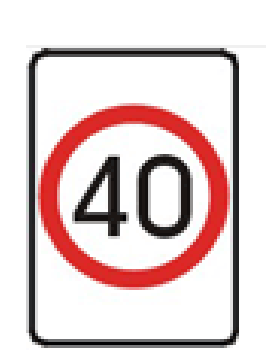
Speed Limit Do not exceed 40km/h in school zones.