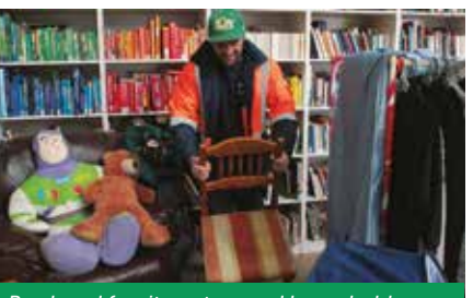
Pre-loved furniture, toys and household goods are all for sale on Super Saturdays.

These popular events occur on the last Saturday of every month when donated items are sold to the public.