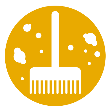
1,393km of streets swept