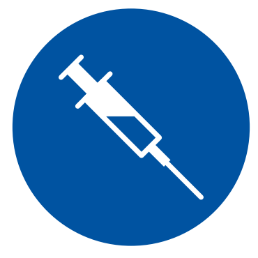
5,600 vaccinations administered to more than 2,500 children

Here's a snapshot of how your money was spent in 2014/15.