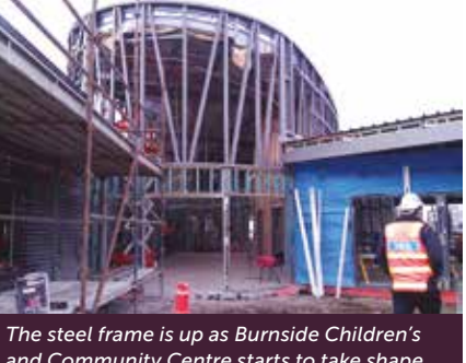
and Community Centre starts to take shape