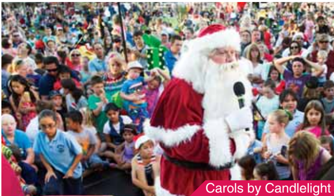
Carols by Candlelight

For more information about any of Council's fantastic community events, visit melton.vic.gov.au/events