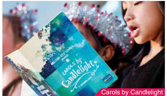
Carols by Candlelight