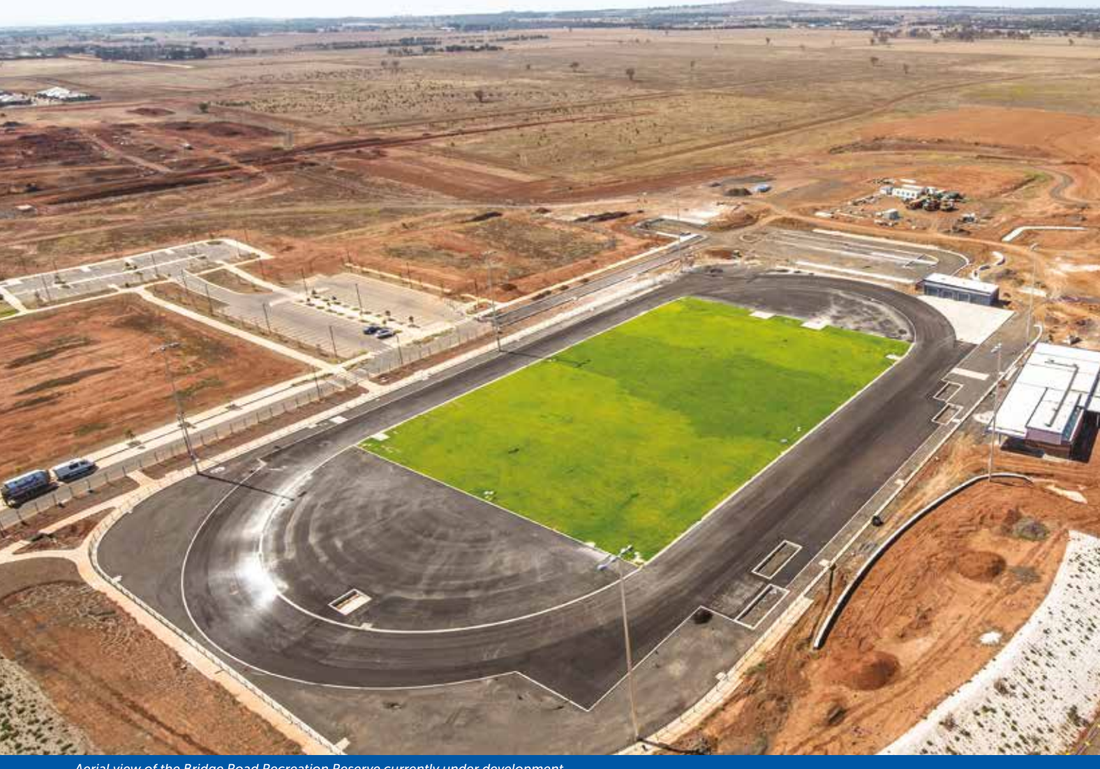
Aerial view of the Bridge Road Recreation Reserve currently under development.