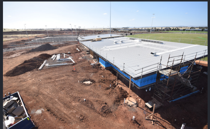
EYNESBURY RECREATION RESERVE STAGE 1B

For updates on more local infrastructure projects, visit melton.vic.gov.au/majorprojects