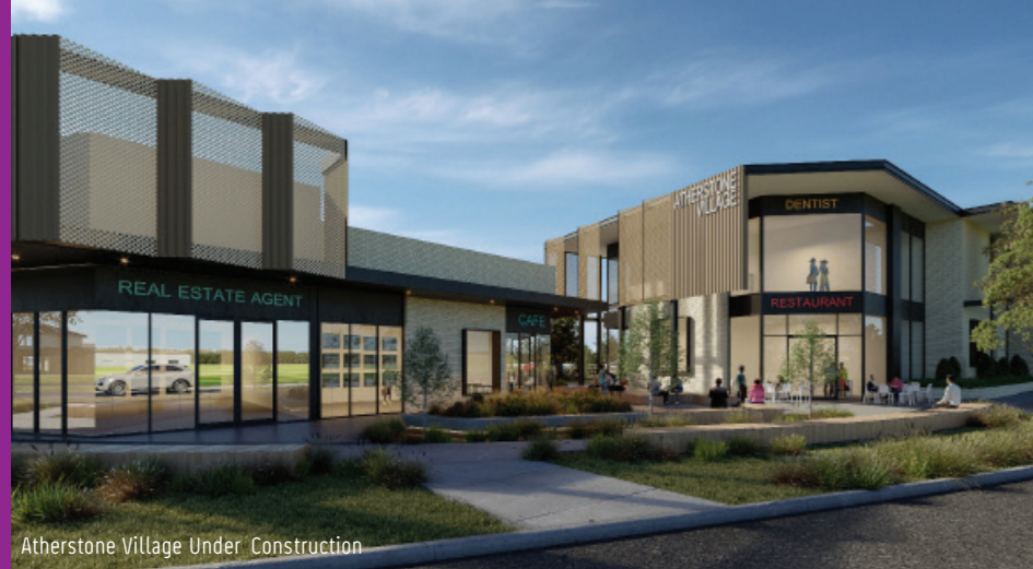
Atherstone Village Under Construction