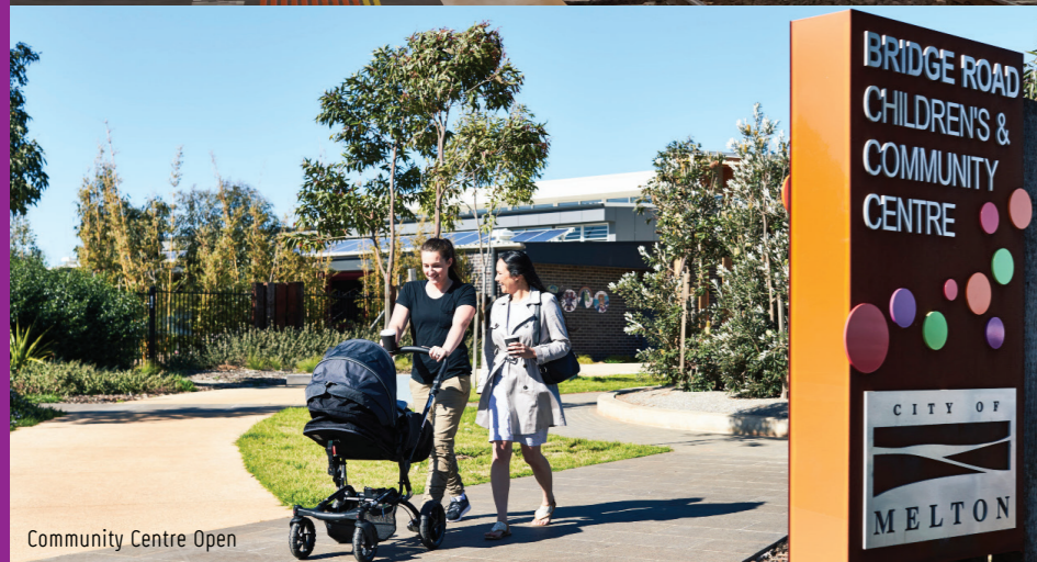
Community Centre Open