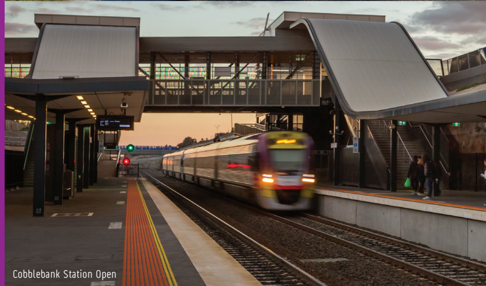
Cobblebank Station Open