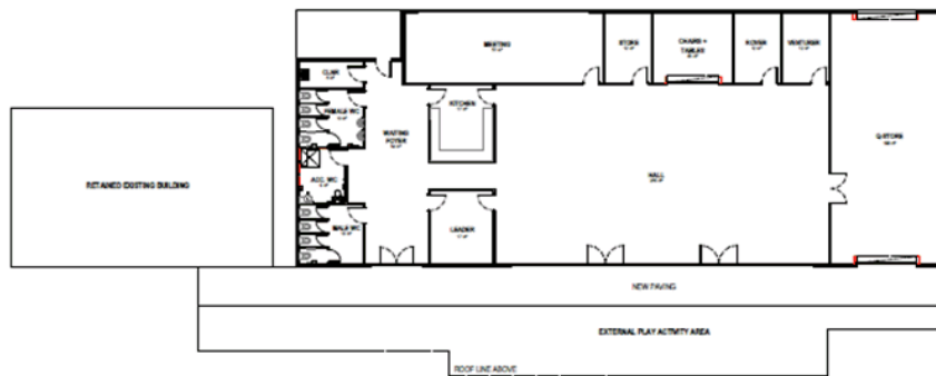
OPTION 1 - FLOOR PLAN