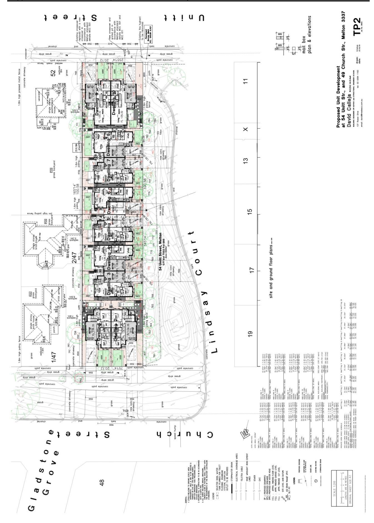
Item 12.12 Planning Application PA 2019/6515 - Development of the land for the purpose of ten double-storey dwellings At 54 Unitt Street and 49 Church Street, Melton