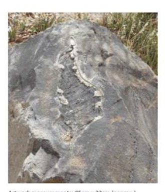
Artwork measurements: 40cm x 50cm (approx.)