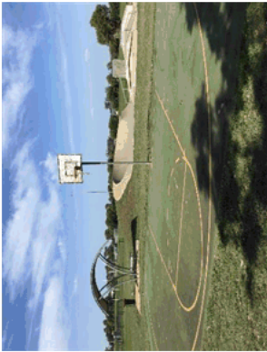
Basketball ½ court