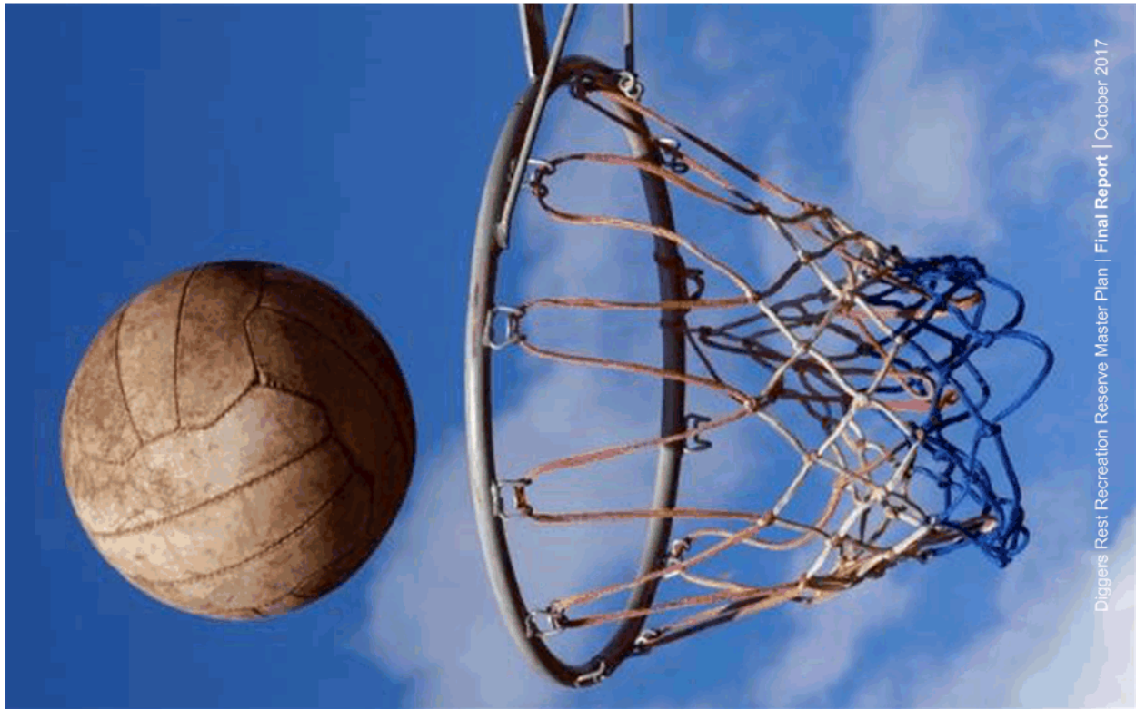
Diggers Rest Recreation Reserve Master Plan | Final Report | October 2017

A detailed consultation schedule and individual stakeholder needs summary is provided in Part B of the Diggers Rest Recreation Reserve Master Plan Project (Key Findings Report).