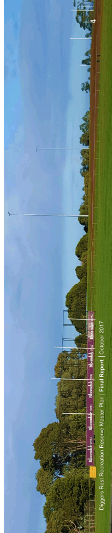
Diggers Rest Recreation Reserve Master Plan | Final Report | October 2017

Note: The Diggers Rest Precinct Structure Plan has provision for an additional eight hectares of active open space (Davis Road Community Hub) that will be designed in conjunction with the local community. This site will provide opportunity to address any gaps in facilities that are unable to be accommodated at Diggers Rest Recreation Reserve.