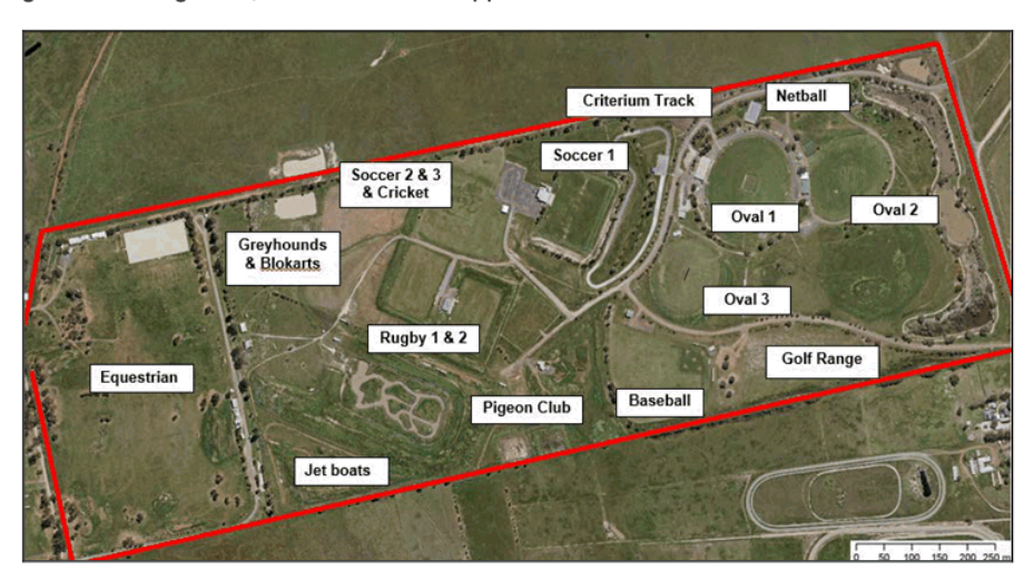
Figure 2 - Existing Sporting Facilities at MacPherson Park Recreation Reserve

The western precinct comprises of the Melton Equestrian Park and a 400m straight grass coursing track, and associated support facilities.