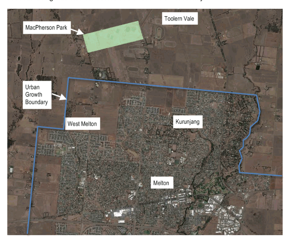
Figure 1 - Map Showing Location of MacPherson Park Recreation Reserve

MacPherson Park accommodates a range of sports servicing both local catchments and beyond, including football, cricket, soccer, rugby union, rugby league, gridiron, baseball, netball, pigeon racing, blokarting, greyhound racing, and equestrian activities. Jet boat racing was also conducted at the reserve until recently.