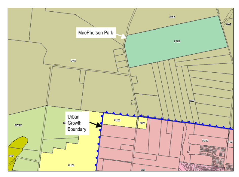
Figure 3 - MacPherson Park Planning Zones

MacPherson Park is not the subject of any planning overlays.