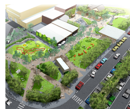
View from the corner of Palmerston and McKenzie Street towards High Street.

In the interim you can find the Visitor Information Centre at its temporary home in the Melton Library and Learning Hub, 31 McKenzie Street, Melton. Visitor enquiries can call 9747 7300 or email visitor@melton.vic.gov.au