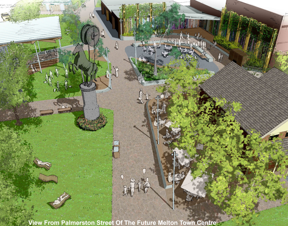
View From Palmerston Street Of The Future Melton Town Centre