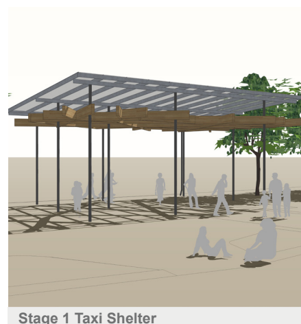
Stage 1 Taxi Shelter

There will be minor rectification works to follow immediately after the completion of the Taxi Shelter to enable customers to safely access and utilise the existing Palmerston Street car park, prior to commencement of Stage 2 of the Melton Town Centre Redevelopment. These works are anticipated to be completed by mid October 2015.