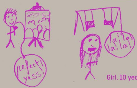
Girl, 10 years old

I would like melton to be a more speeling happy place and Artistic.