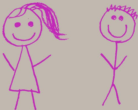
Girl, 12 years old

A beautiful, safe place, clean and happy.