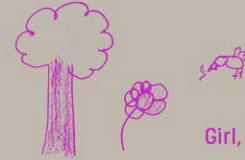
Girl, 9 years old

I want Melton to be more aware of the environment.