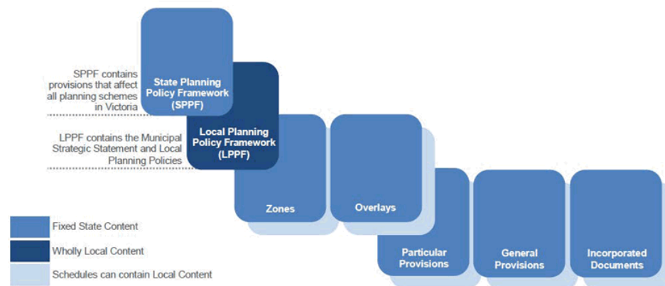
Figure 1: Components of a Planning Scheme

The findings of the MSS Audit were used to draft a new MSS, which was adopted by Council in 2008. Shortly after the adoption of the 2008 MSS, the State Government significantly changed the location of the Urban Growth Boundary (UGB) affecting Melton. This rendered the redrafted MSS redundant as it conflicted with the new policy direction of the SPPF. The changes to the UGB were so substantial that a new MSS must be rewritten.